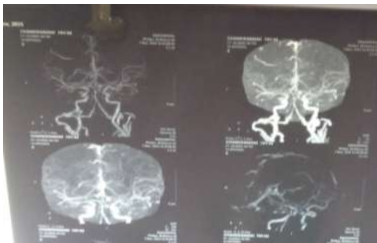
fig 3: ct angiography